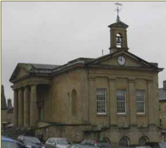
The Town Hall

Chipping Norton, set up by royal charter in 1607. Now it houses the Town Clerk, visitor information Centre and a District Council Office.