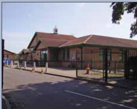
Deal Paochial C of E Primary School

Aspire Nursery Hornbeam Primary School Mongeham Road, Mongeham Deal CT14 9PQ Tel: 01304 363360