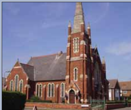
Walmer Baptist Church