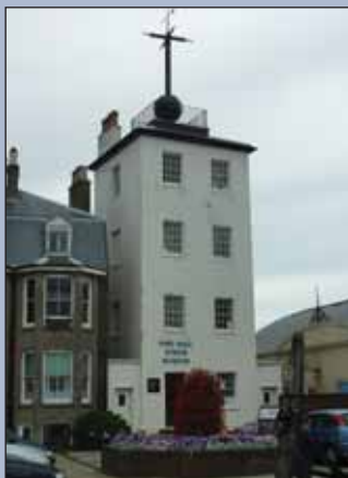
Time Ball Tower

the storage of contraband. Tubs of brandy, off-loaded from French boats in mid-Channel, were sold in Britain for 36 shillings, six times their cost value.