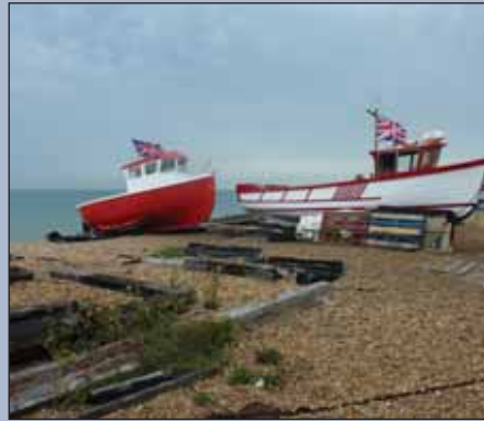
Foreshore at Deal

In it you will find a wealth of local references, neatly gathered together in easy-to-find sections. It has a street map on the centre pages, which can be invaluable when looking for an unfamiliar road. A listings section is included in the back of the guide to help you find the address or telephone number of local schools etc.