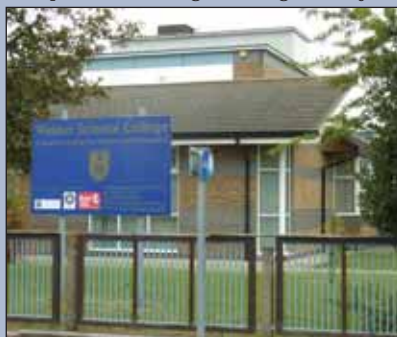
Walmer Science College

Deal has an excellent range of primary and special schools.