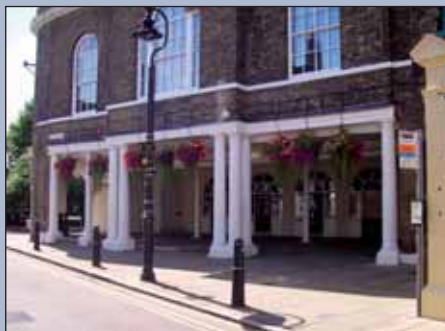
Deal Town Council