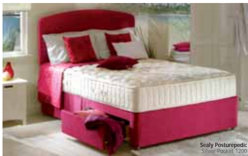
Sealy Posturepedic Silver Pocket 1200