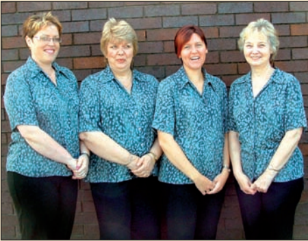
Community Centre staff

Centre and enquiries can be made via 01922 414768, day time and evenings. Members of staff will be on duty during your function to support and assist during your time at the Community Centre.