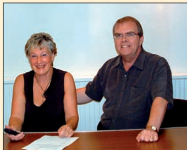
The Secretary and Clerk