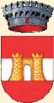
The Municipal Coat of Arms of Quiliano

Following preliminary meetings between representatives of both authorities during May 1999 it was agreed to sign a document of intent. In that same year mutual exchange visits were undertaken.