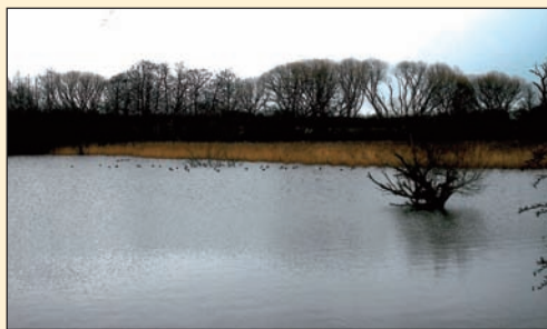
The Pool by Garrets Brook

In Alfred the Great's time the Treaty of Wedmore cited the Watling Street as the dividing line between the Saxons in the south and the Danes in the north. The Saxons were still in Wyrley when the Normans came, and William the Conqueror allowed a Wyrley Saxon to remain as the Forester of Cannock Chase.