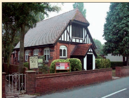
Upper Landywood Methodist Church