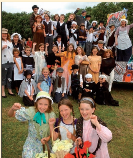
School children on Carnival Day

The old school had a long and successful history right up to the early 1970's when a new junior school was built. The old building could no longer cope with the needs of an expanding community. In 1972 Landywood Junior School was opened by Sir Patrick Cormack MP.