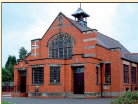
Great Wyrley Methodist Church