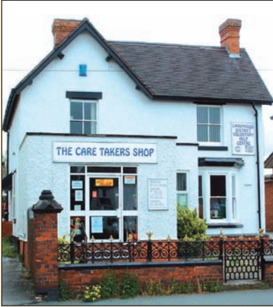
Landywood and District Voluntary Help Centre

Voluntary work does not affect unemployment benefit. It can be very rewarding and a good way of meeting a new range of friends. We urgently need drivers for our own transport plus escorts with carers to help as hostesses (during the daytime and evening) and support teams for the enquiry desk and Centre shop. Tel. No. 01922 418381.