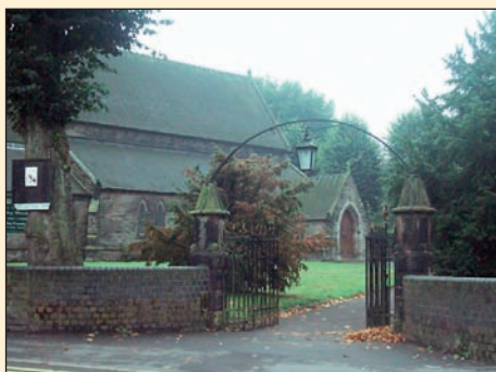
St Mark's Church