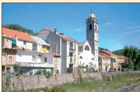
The Church of St Lorenzo – Quiliano

In the environs of Quiliano remain several Roman archaeological sites: a Roman bridge still functions in the valley of Quazzola and remains of a Roman villa may be seen at San Pietro in Carpignano.