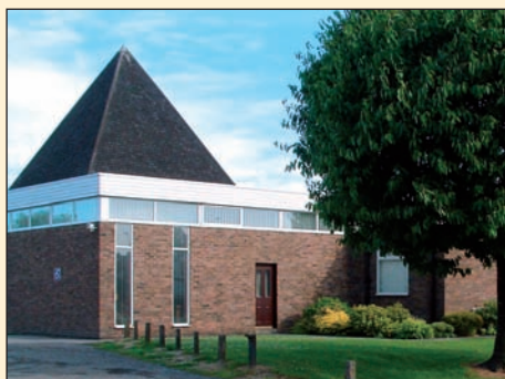
St Andrews Church