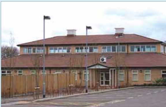
Ash, Cartwright & Kelsey School

Independent schools also flourish in the area. Dover College (11-18 boys) enjoys a healthy sporting rivalry with Sir Roger Manwood's. Other independent schools in the area include Northbourne Park School, Betteshanger; St Faithis Prep School, Ash.