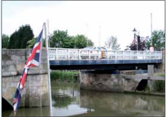
Tollgate to Sandwich Bay

Sandwich has enjoyed strong links with Europe down the centuries. Throughout its history it has been vulnerable to invasion and suffered attacks from Angles, Jutes, Saxons, and Danes as well as the French. Between the 11th and 13th centuries it had