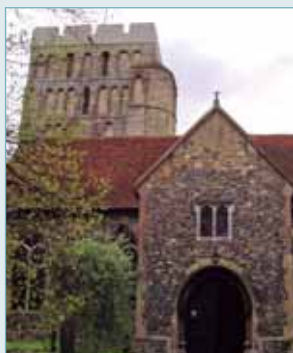
St Clement C of E Church Sandwich