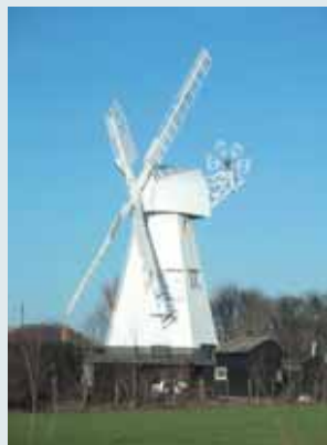
The White Mill

Ash Road, Sandwich CT13 9HZ Tel: 01304 617774 www.kent.fire-uk.org