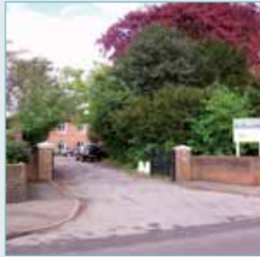
St Bart's Day Nurseries

Tel: 0808 2000 247 A freephone, 24 hour national domestic helpline.