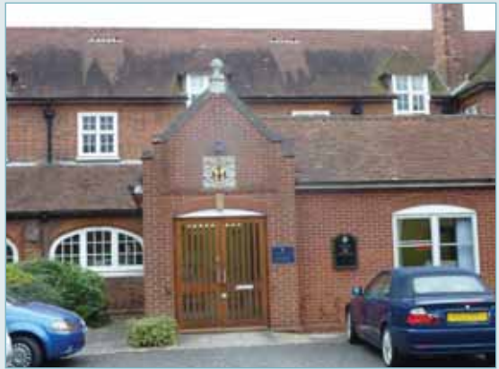
Sir Roger Manwood's Grammar School