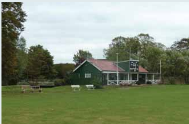
Sandwich Cricket Club

Sandwich Cricket Club - Established in 1823, the club plays at The Butts, a short walk from the town centre. It has ECB Clubmark status and is one of the best clubs in the Kent League. Six teams are fielded on Saturdays, and three on Sundays. Junior development courses are a priority. The club runs age level teams from U9-U15. The withdrawal of the Pfizer empire from Sandwich has cost the club several players, but replacements have been recruited for the 2012 season.